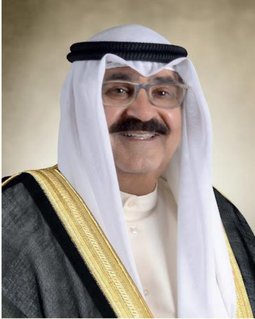
سمو ولي العهد

الشيخ / مشعل الأحمد الجابر الصباح — حفظه الله ورعاه —