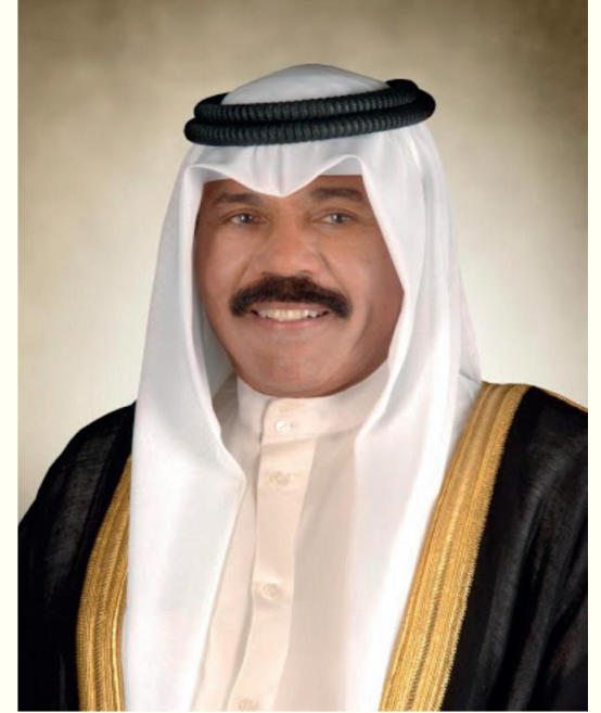
صاحب السمو أمير البلاد

الشيخ / نواف الأحمد الجابر الصباح — حفظه الله ورعاه —